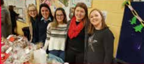
Santa & Mrs Claus